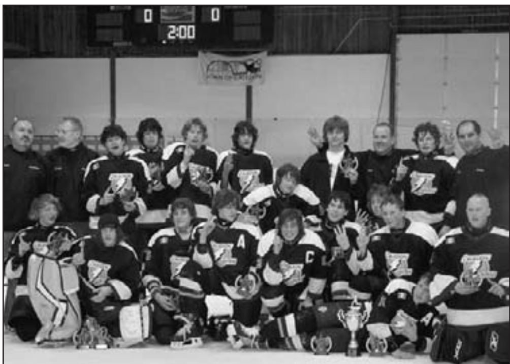
The Caledon bantam Lightning entered their final tournament in Bolton and came away with the championship hardware.