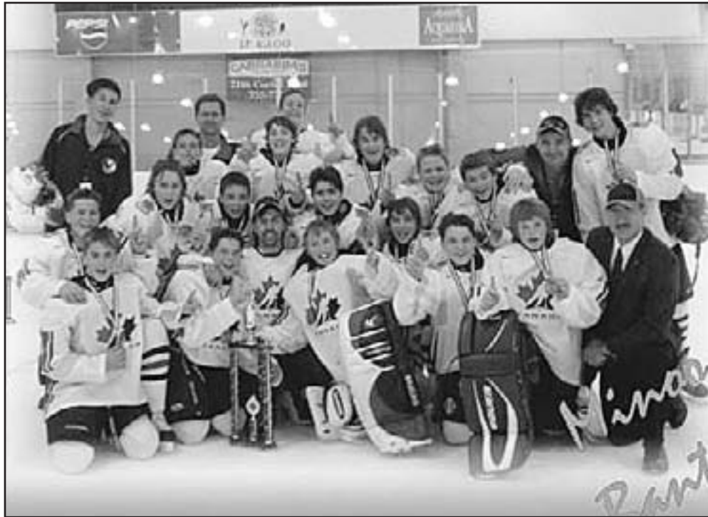
Caledon's minor bantam Hawks took on all comers at the Florida Gulf Coast tournament, taking home the championship hardware.

Check out the new trophy at the Sheardown Memorial Arena in Bolton. Well done Caledon!